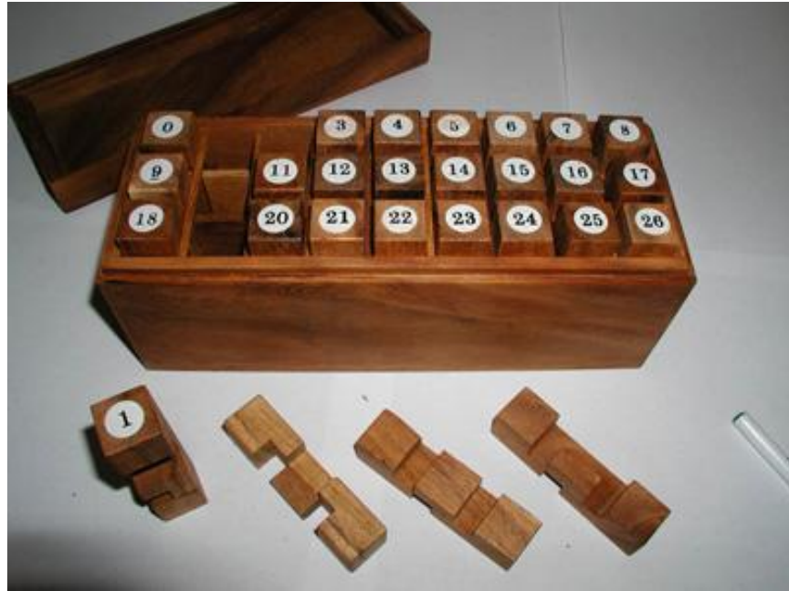
Figure 1. Ultimate Burr Set

The Ultimate Burr Set from Creative Crafterhouse ( www.creativecrafterhouse.com ) is based on the burr set documented in Creative Puzzles of the World by Van Delft and Botermans (1978). The set consists of 27 pieces (all unique) that can be used 6 at a time to assemble a burr puzzle.